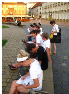
The ELASA-ians sketching

The 2009 ELASA annual meeting took place in Romania, a country with a recent strong development of Landscape Architecture. The event was hosted by students from the University of Agricultural Sciences and Veterinary Medicine of Banat Timisoara. The participants: students from all over Europe had the chance to find out about beautiful landscapes, historical monuments and valuable sites and familiarize themselves with the Romania tradition and culture.