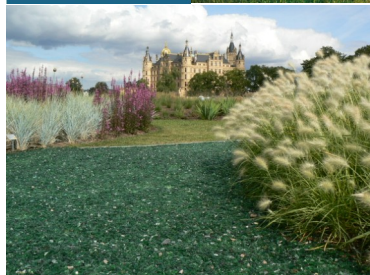
The BUGA in Schwerin, Germany

"IF SUCH FESTIVALS TAKE PLACE IN PORTUGAL OR FRANCE OR GERMANY, EACH COUNTRY FINDS HERE MEANS TO EXPORT ITS LANDSCAPE THINKING TANKS TO THIS IDEAS' MELTING POT".