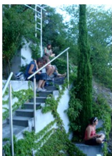
The students relaxing after a laborious day

As ELASA moves forward into the upcoming year a focus and emphasis has been made on the need for ongoing support, passion and enthusiasm. As the lifeblood of the organisation (the meetings) become more financially challenging, it is time more than ever to call on the support and expertise of its members. It is our aim that students increasingly share their knowledge of their own country as well as drawing upon the knowledge and expertise of professionals. With this in mind we can continue to strengthen the reputation of Landscape Architecture at all levels, whether in local Universities, national structures or internationally across Europe.