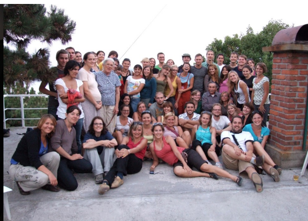
Atmosphere from the ELASA meeting in Romania