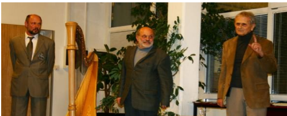
The atmosphere from the award ceremony