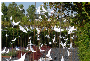
Origami Garden at the Ponte de Lima Festival in Portugal