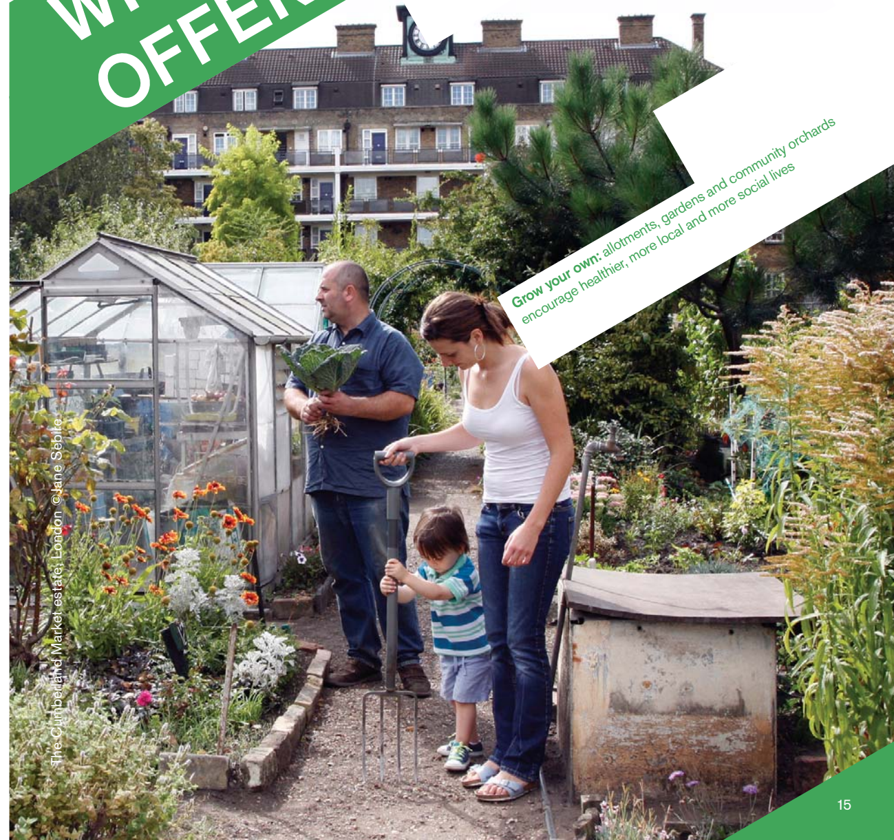
The Cumberland Market estate, London

Grow your own: allotments, gardens and community orchards encourage healthier, more local and more social lives